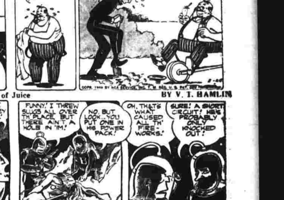
(Reprinted by The Bell Syndicate, Inc.)