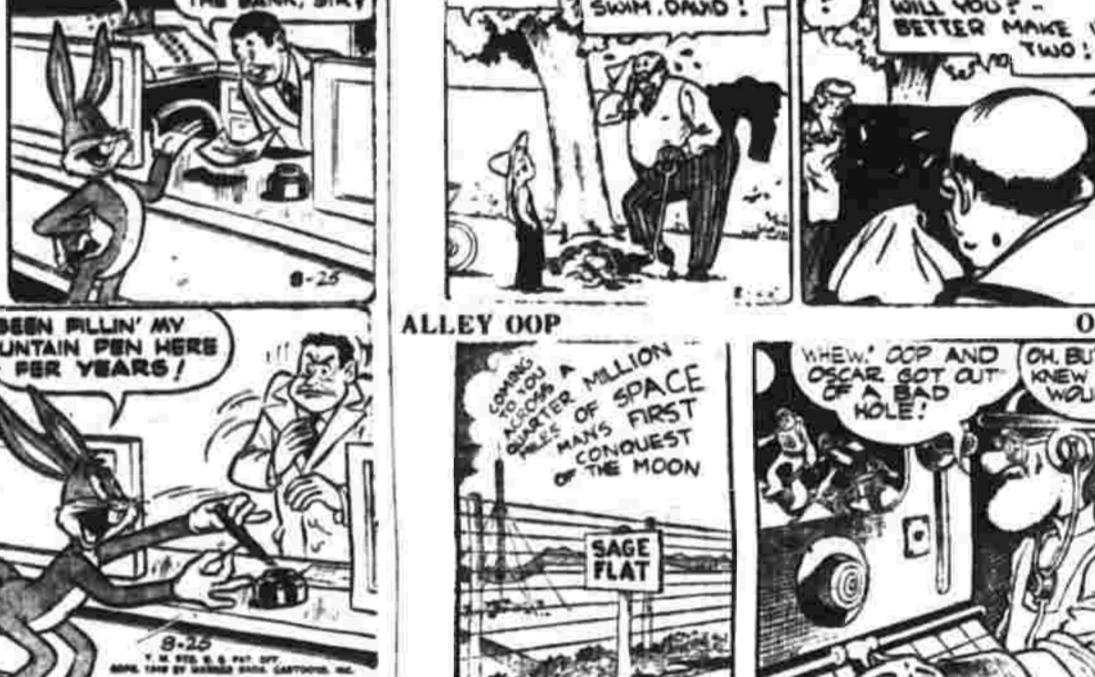
(Reprinted by The Bell Syndicate, Inc.)