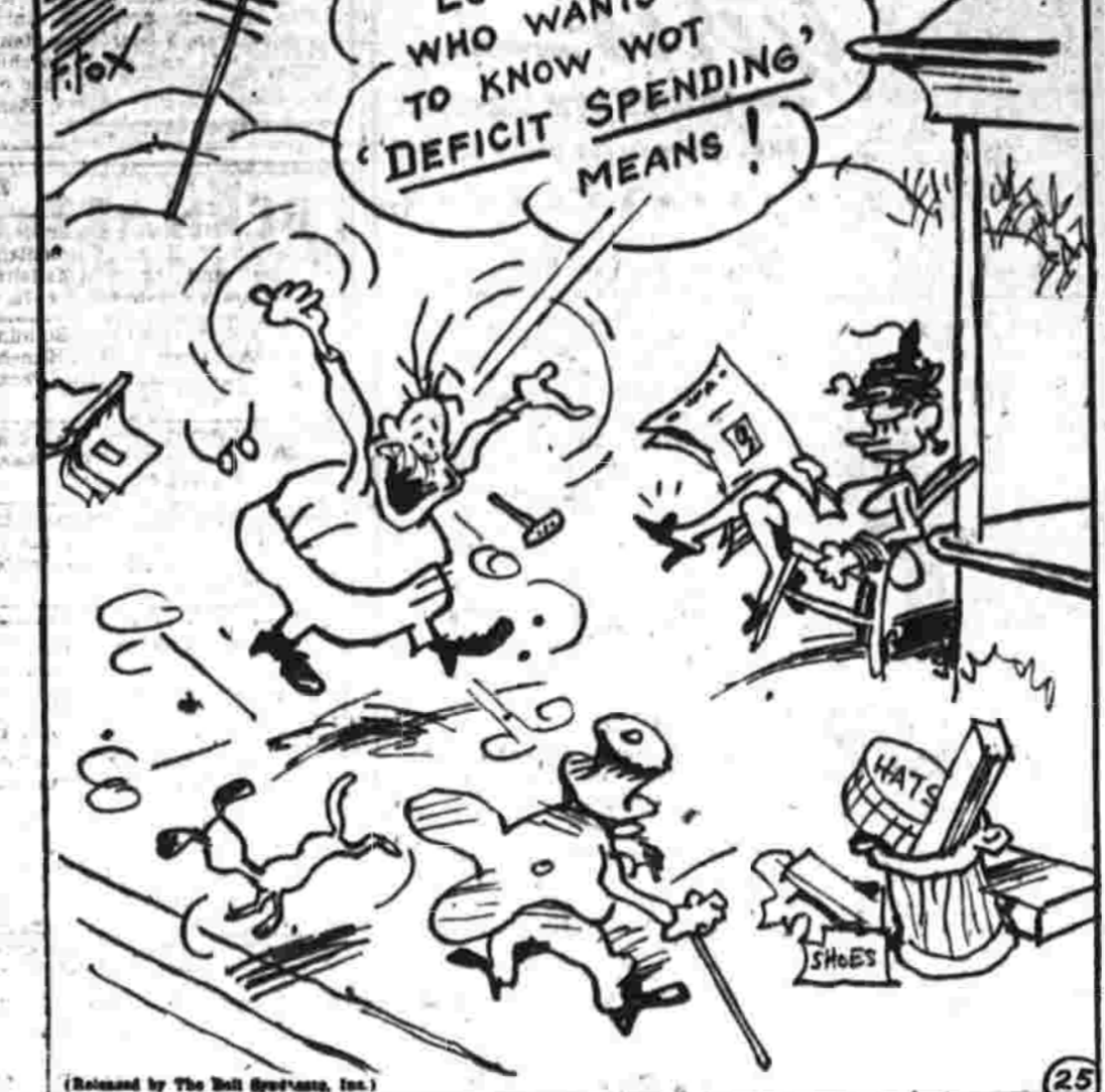
(Reprinted by The Bell Syndicate, Inc.)