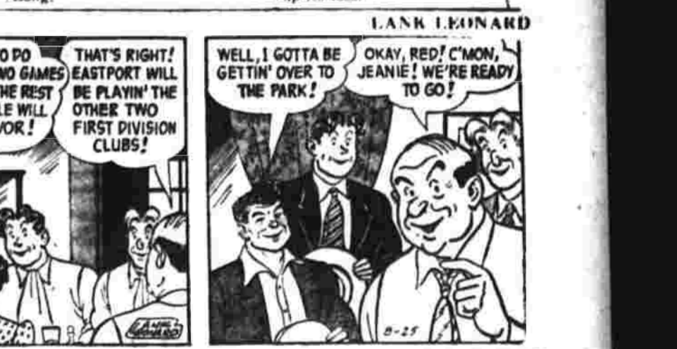
(Reprinted by The Bell Syndicate, Inc.)